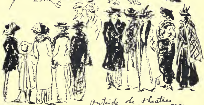
Outside the Theatres at 11.15 P.m.